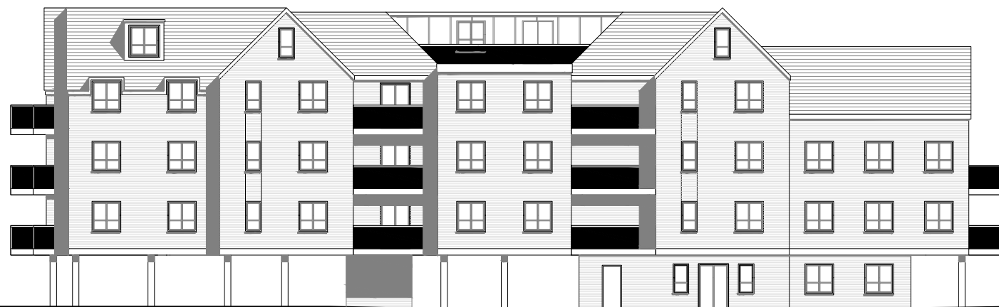
Proposed South (Side) Elevation - BB

Proposed Elevations - East and South Scale :1-250 @ A3