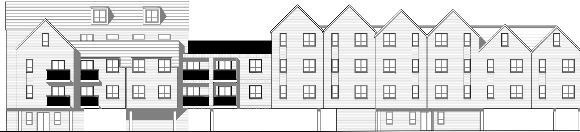
Proposed East (Front) Elevation - AA