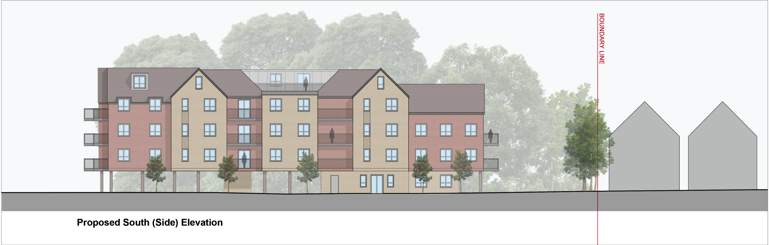
Proposed South (Side) Elevation