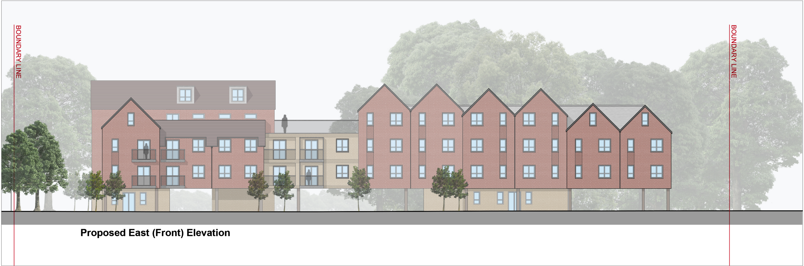
Proposed East (Front) Elevation

Use figured dimensions only. Scale drawing only when a scale bar is present. All dimensions to be checked by user and any discrepancies, error or omissions to be reported to the architect before work commences. Read this drawing with all relevant materials.