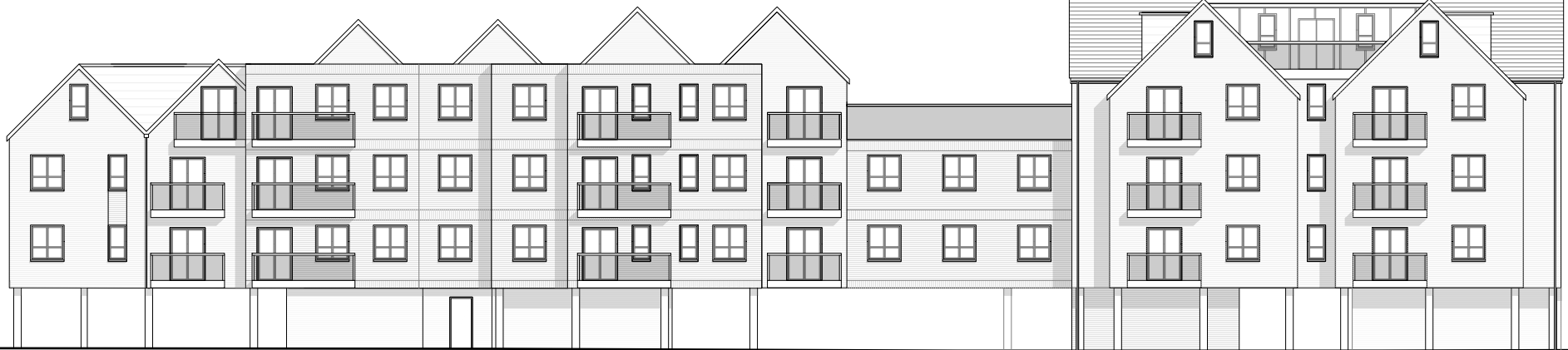
Proposed West (Rear) Elevation