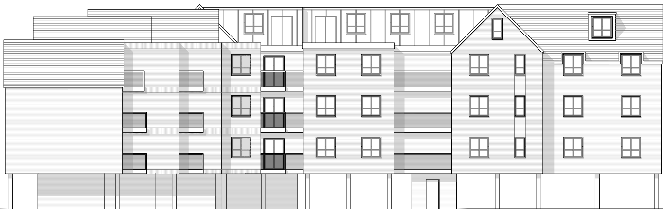
Proposed North (Side) Elevation